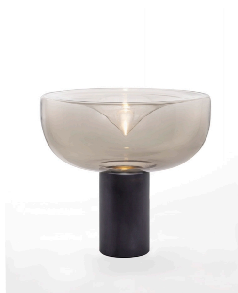
Finish: matte gunmetal