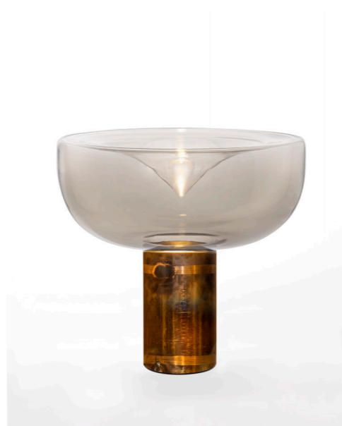
Finish: raw brass