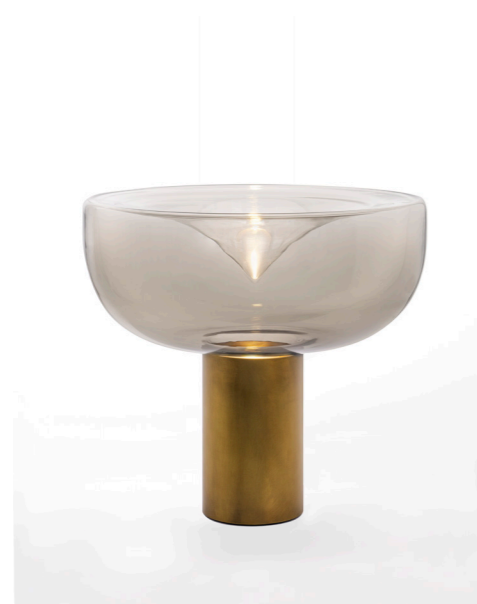
Finish: vintage brass