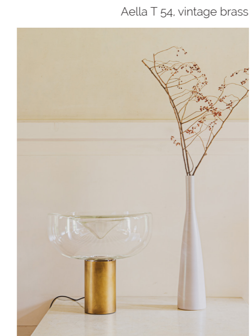
Aella T 54, vintage brass