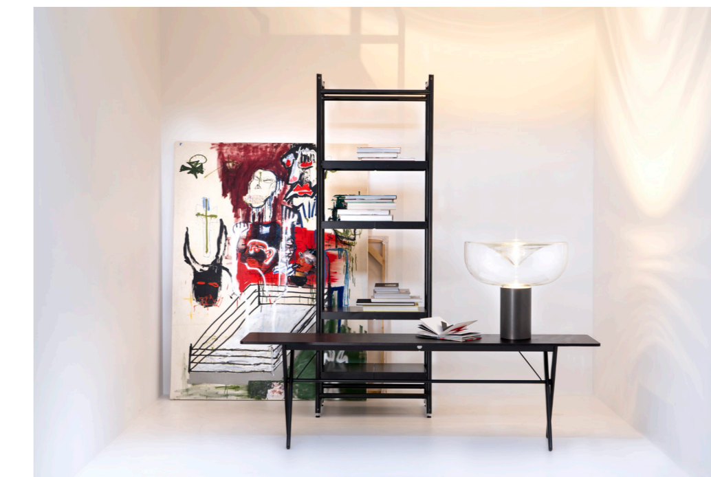
Aella S 54, matte gunmetal