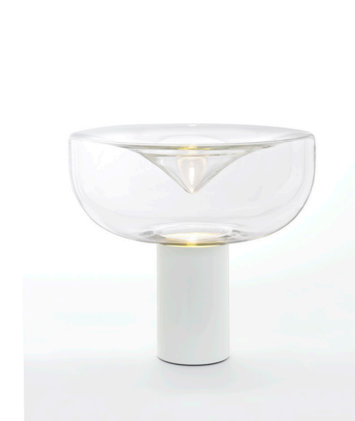
Finish: glossy warm white

I LED (2700K o 3000K) possono essere facilmente sostituiti dall'utente.