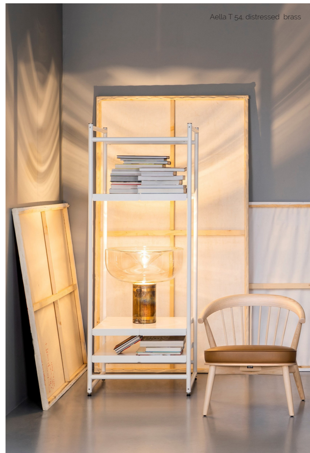
Aella T 54, distressed brass