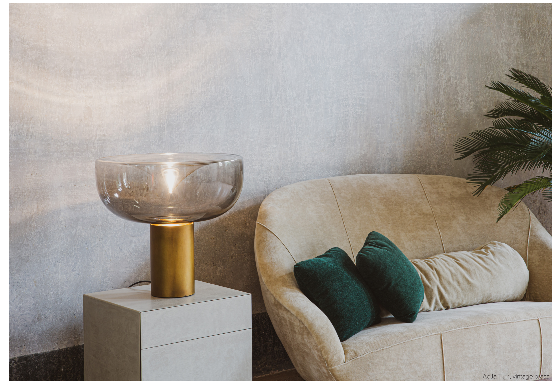
Aella T 54, vintage brass